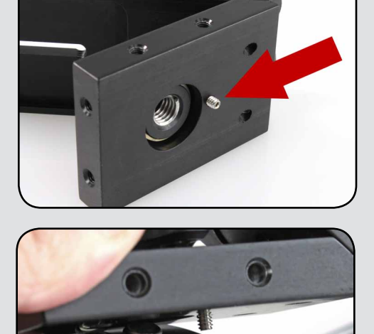
Plate while allowing for quick adjustments. Technically the plate can be mounted to any 3/8" stud if you have special requirements.